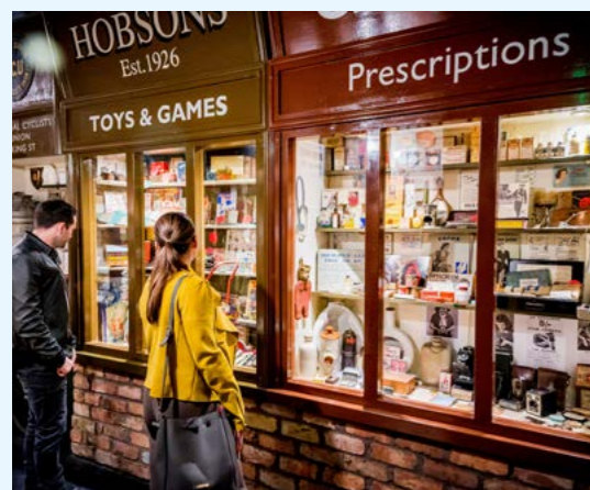
Amgueddfa'r Home Front | Home Front Experience