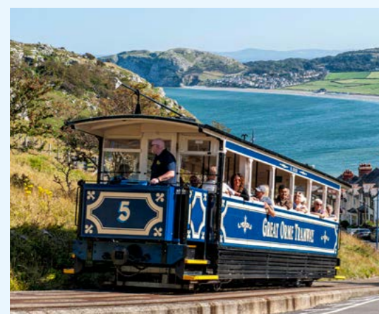
Tramfordd y Gogarth | The Great Orme Tramway